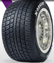
CIRCUIT RADIAL WET